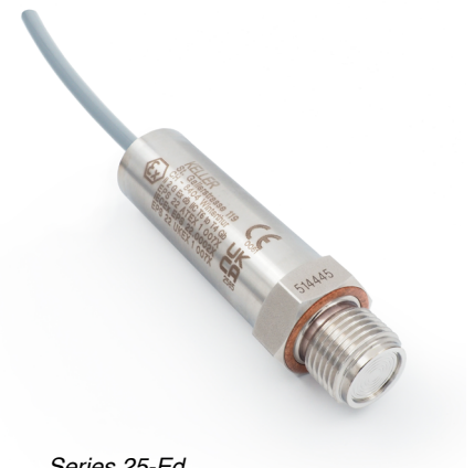
Series 25-Ed Series 35X-Ed