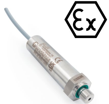
Series 23-Ed Series 33X-Ed

T4: -40\text{ °C} \leq T_a \leq +100\text{ °C} , T5: -40\text{ °C} \leq T_a \leq +95\text{ °C} , T6: -40\text{ °C} \leq T_a \leq +80\text{ °C}