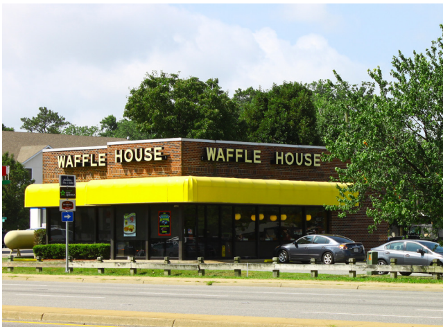
Large amounts of grease from restaurant chains put a strain on sewage systems

Newport News, Virginia in the USA offers a good example of what can happen in such a situation. Newport News was founded in 1621. It is situated along the James River and its nearly 180,000 residents make it the fifth largest city in Virginia. Here, several restaurants were built in an area serviced by the same municipal wastewater lift station. The high grease content in the wastewater then polluted the existing level measurement equipment, ultimately leading it to break down completely.