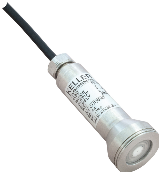
36 XKY level transmitter with Kynar® membrane

The Kynar® membrane used in the 36 XKY is harder and offers superior abrasion and puncture resistance relative to other non-fouling solutions. Bulky shields are therefore no longer needed, which also enables a more compact design for the sensor. The 36 XKY can fully exploit the advantages offered by a non-fouling membrane without anyone having to worry about floating particles and small objects. Put simply, the level transmitter is perfect for this application. No incorrect measurements due to grease deposits have been recorded at Newport News Waterworks since the new transmitters went into operation: The LevelRat solved the problem.