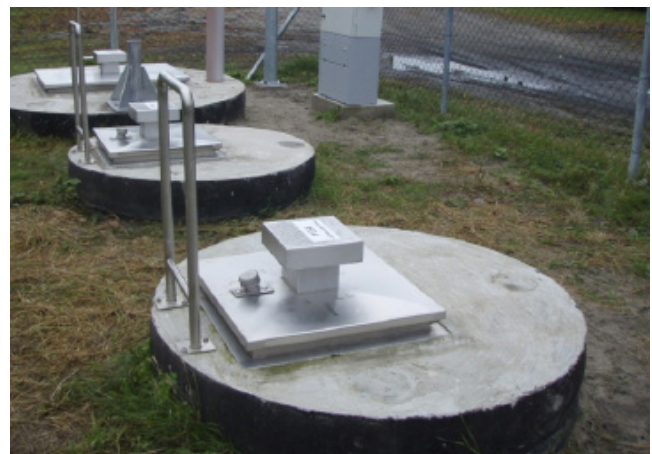
Above ground lift station at a sewage plant