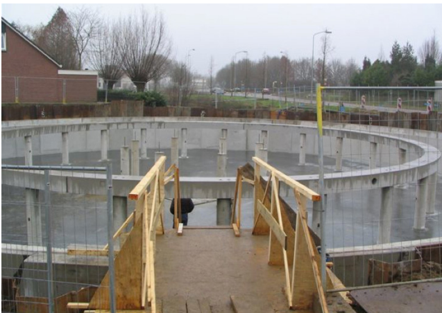
Wastewater buffer tank

the dividing wall for each measurement of the water column. The remainder is then the water level on top of the sewer barrier. The system then calculates the average of all measured water levels and converts this into a flow rate (volume/time). The module now multiplies the average flow by the total time period of the overflow, which yields the total volume of overflow wastewater. Once this process has been completed, the KELLER software automatically generates an official report for each overflow location. The report lists the number of overflows and the amount of overflow wastewater in each case. Government agencies, such as “Waterschap” in Holland, can use this information to develop and implement additional measures. The reports also provide an overview of locations negatively affected by bottlenecks and insufficient capacity. Should overflows become more frequent, the Dutch government can instruct local governments to build additional wastewater buffers, for example.