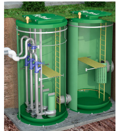
Sewage pumping stations equipped with a continuous measuring system to control the level of wastewater capacity