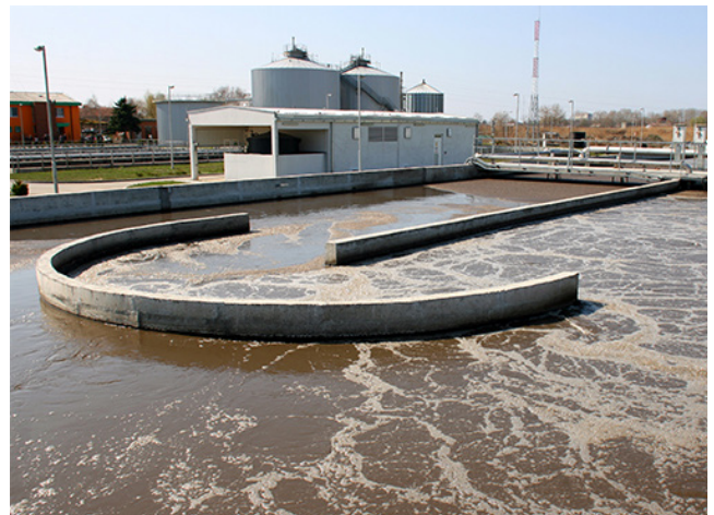
Wastewater treatment plant in Newport News

The heightened grease content in the wastewater caused by the restaurants led clumps to form on the level transmitter membranes, which ultimately blocked the flow of water to the measuring membrane. On the redundant float switch, whose purpose was to trigger the pump in the event of a failed level transmitter, the accumulation of grease blocked the mechanical operation of the float ball. The failure of the level transmitter and the backup system led to the failure of the entire lift station because the pumps either operated constantly or not at all. If technicians hadn't acted quickly, the entire sewage system could have come to a complete standstill.