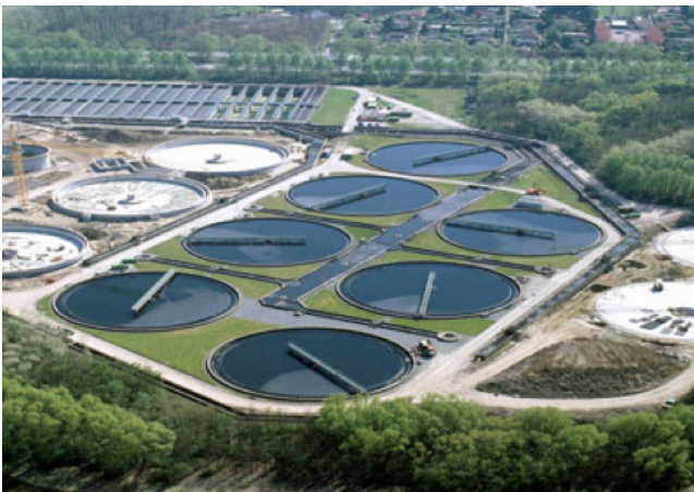
Wastewater treatment plant

can cause “fountains” of wastewater to shoot out of sewer openings and possibly even contaminate drinking water. That’s why spillover walls are installed in sewer systems. On the other side of these walls are rivers or canals. When necessary, the excess water flows over the wall and into the natural water. This setup is actually only an option for an extreme emergency, however, as it cannot prevent pollutants and contaminants from making their way into the environment. It’s therefore crucial to precisely determine where and in which amounts sewage runs off via this emergency spillover system. KELLER AG supplies the pressure measurement technology needed for this. Here, KELLER “Logger” software calculates the total spillover volume using data from the DCX-22 AA data logger, which measures water levels. Three trigger levels for the data logger can be set in the “Logger” software system in order to regulate the logging speed and the initiation of the flow calculation. The DCX-22 AA is installed in the sewer system with the level sensor placed as low as possible. The battery compartment is installed just below the manhole cover on the pavement or the street.