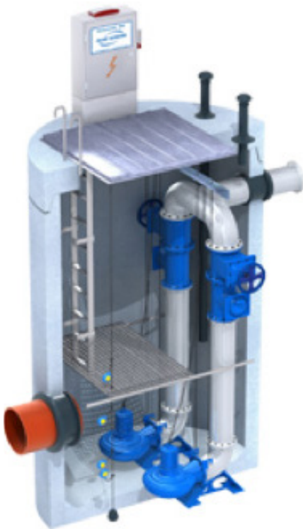
Underground lift station at a sewage plant

The pressure transmitters for level measuring serve as the main sensors for wastewater level monitoring, whereas the floating switches are used as a secondary control element. The main advantage of the 46 X is a chemical-resistant AL 2 O 3 membrane with a gold layer, which is also more resistant to mechanical damage than a steel membrane. Modern digital electronic systems enable free scaling of the 4-20-mA output, as well as the incorporation of the unit into a MODBUS communication network. In addition, the 46 X displays outstanding reliability in this extremely tough application.