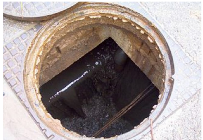
Installation of the DCX-22 AA unit in a sewer system