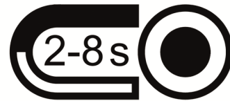
Figure 2: Symbol indicating the correction position on the type plate

After the last step has been completed, the currently applied pressure will be stored as the zero point.